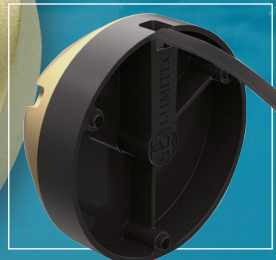
4" Dia. X 1.6" D