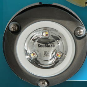
3" Dia. X 1.2" D

Lumens: 2000+ Output: Dual Color white/blue or RGBW Spectrum Voltage: 10-30vDC CCT: 6500K