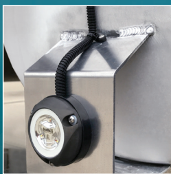
Mounts to a standard transducer/accessory bracket

Zambezi underwater light, like its namesake (Zambezi is an African bull shark) is tough, tenacious, and built to survive completely submerged in salt or fresh water. Zambezi's wire and seal are the result of more than 70,000 hours of ingress and long-term permeability testing. This completely sealed surface mount design allows lights to be applied to situations that require surface run wires. From pontoon boats to floating docks, the application possibilities are limitless for this versatile and durable surface mount underwater light.